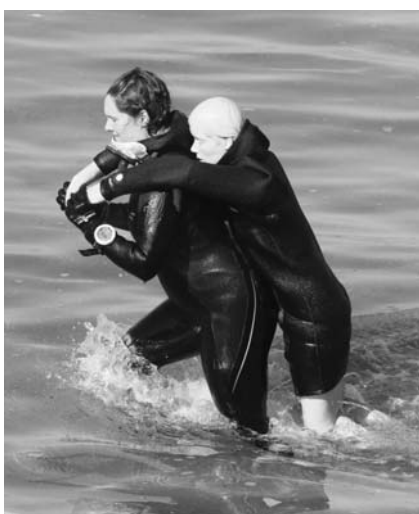
03-Dummy Getting a Free Ride.jpg