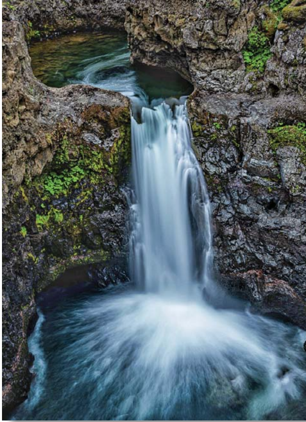
Icelandic Waterfall Bill Shewchuk