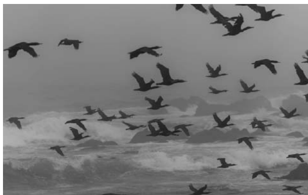
02-Cormorants in Ocean Fog.jpg