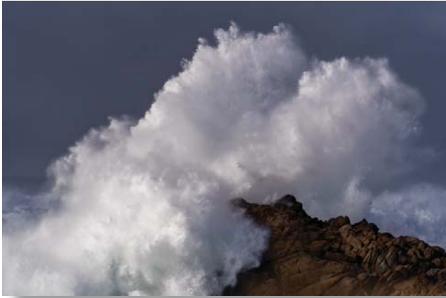
22-Wave Motion Arrested.jpg